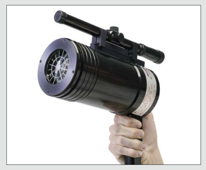
Without Beam Collimator

The specially designed Beam Collimator attachment (part no. 20/20-190) can be used to extend the simulator's testing distance, thus facilitating easier testing and encouraging the testing to be carried out – all without the need for costly access equipment.