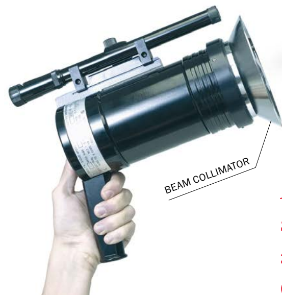
This image is for demonstration only

Avoids the cost of scaffolding or supports to access the detector – able to test at distances up to 29ft (9m) from the detector location!