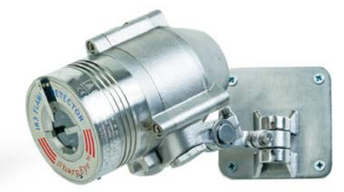
SPECTREX 40/40I TRIPLE IR FLAME DETECTOR

The Spectrex Flame Simulator is the only safe method to test the flame detector's sensors, internal electronics, alarm activation software, cleanliness of the viewing window/lens, wiring integrity, actual relay activation,